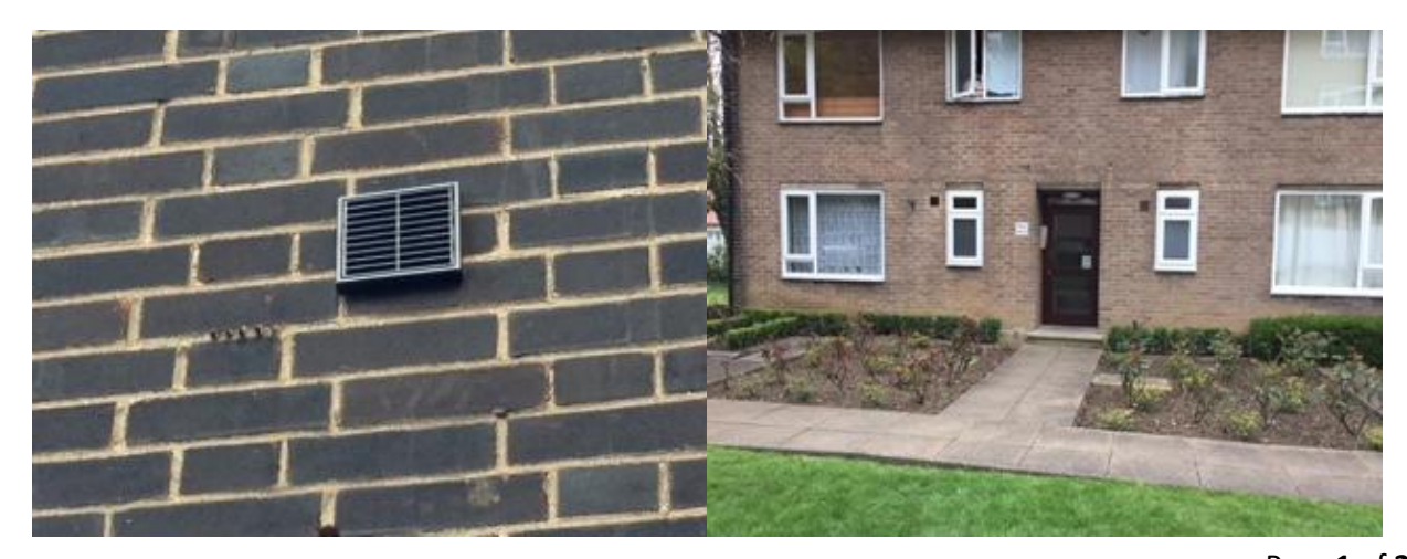
Page 1 of 2

Please see image of vent type and positioning below. This is the front view position (bathroom). Please note the vent should be in the brown colour as shown in the positioning picture not black as shown in the close up image.